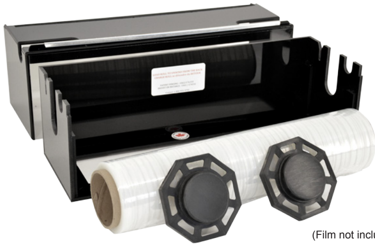
(Film not included)