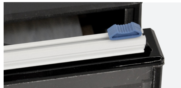
Choice of slide cutter (U.S. Only)