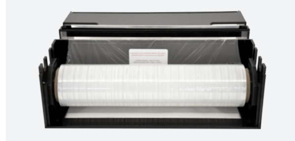
Wrap folds over back before lid is replaced - No feeding of wrap through slots